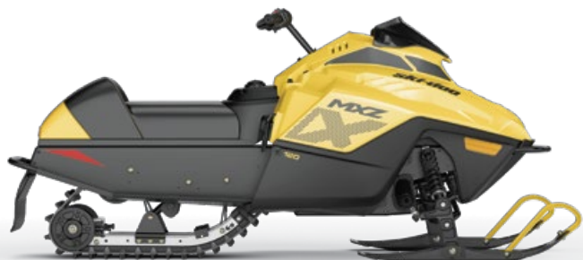
MXZ 120 SHOWN

Now, there's a new way to share the fun and excitement with the whole family.