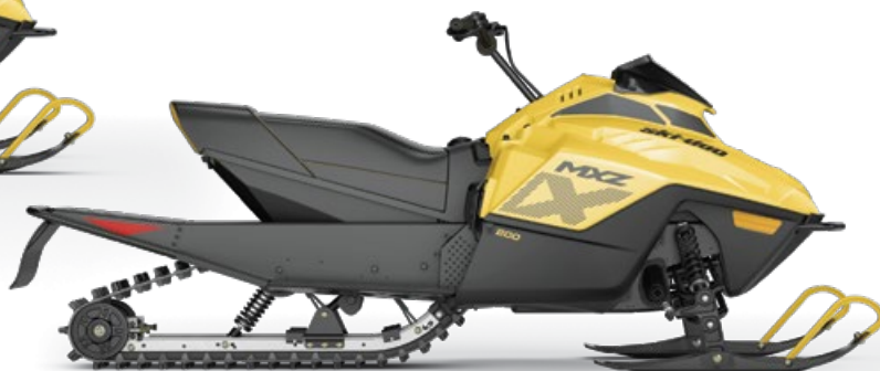
MXZ 200 SHOWN